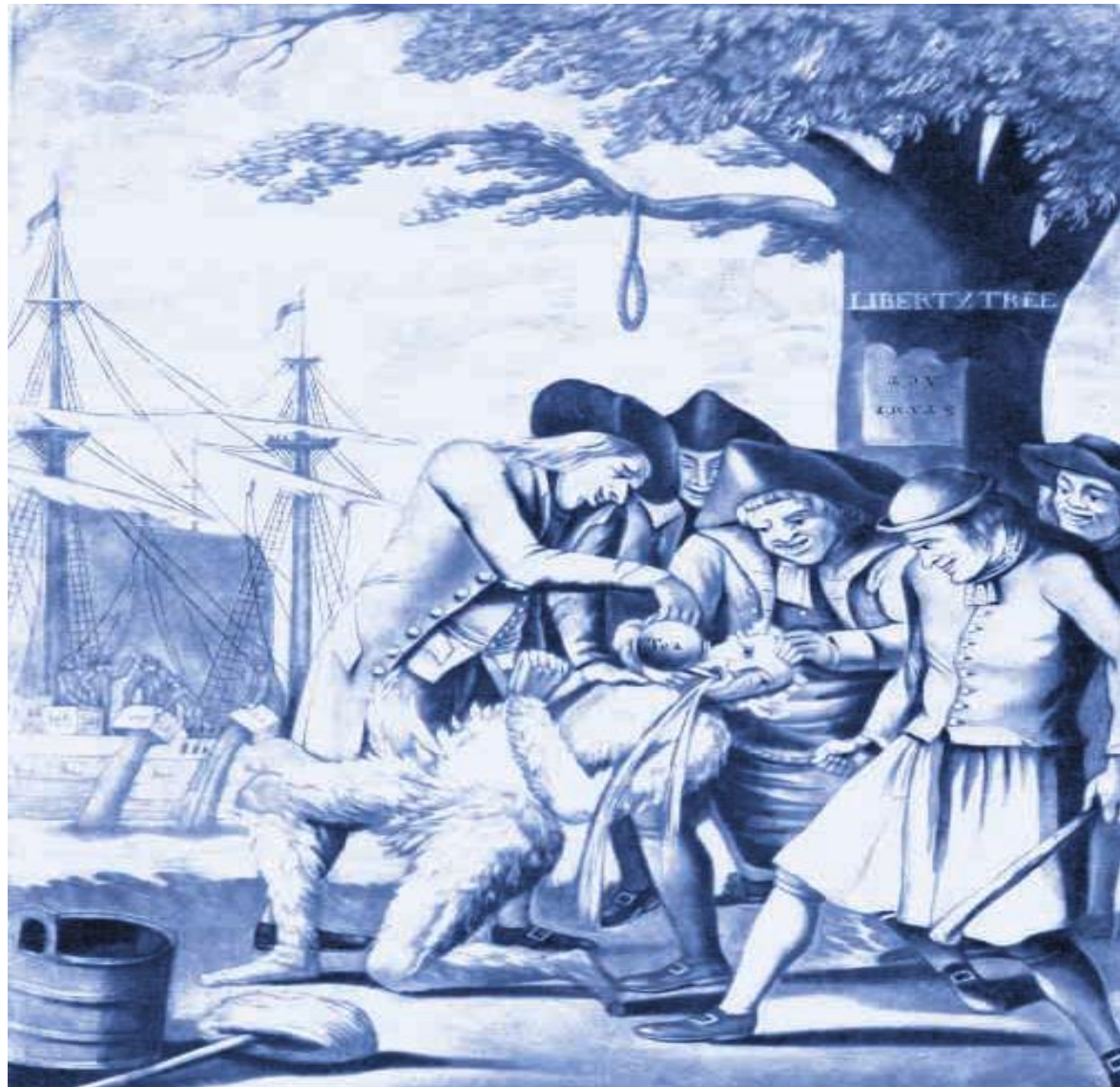
THE BOSTONIANS PAYING THE EXCISE-MAN, OR TARRING & FEATHERING