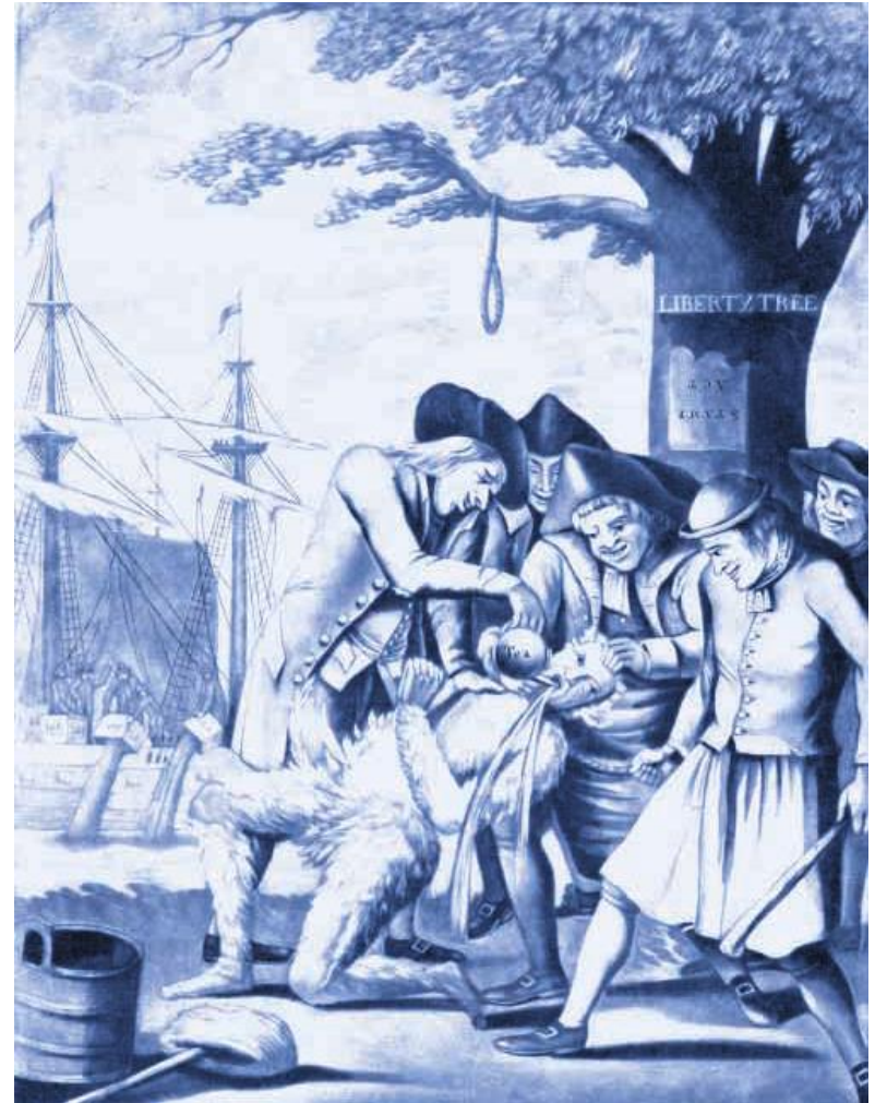
THE BOSTONIANS PAYING THE EXCISE-MAN, OR TARRING & FEATHERING