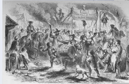
THE STAMP ACT SHOT IN AMERICA.