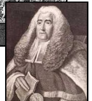
Sir William Blackstone, an → 18th century English judge